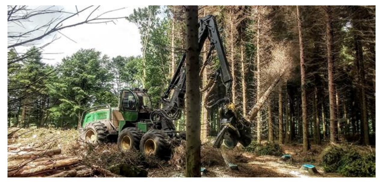
4.34 Where access or maturity of timber dictates that a mechanical means of felling the timber is not practical, it may in some instances be necessary to mulch the standing timber using specialised mulching machinery or to hand fell it.