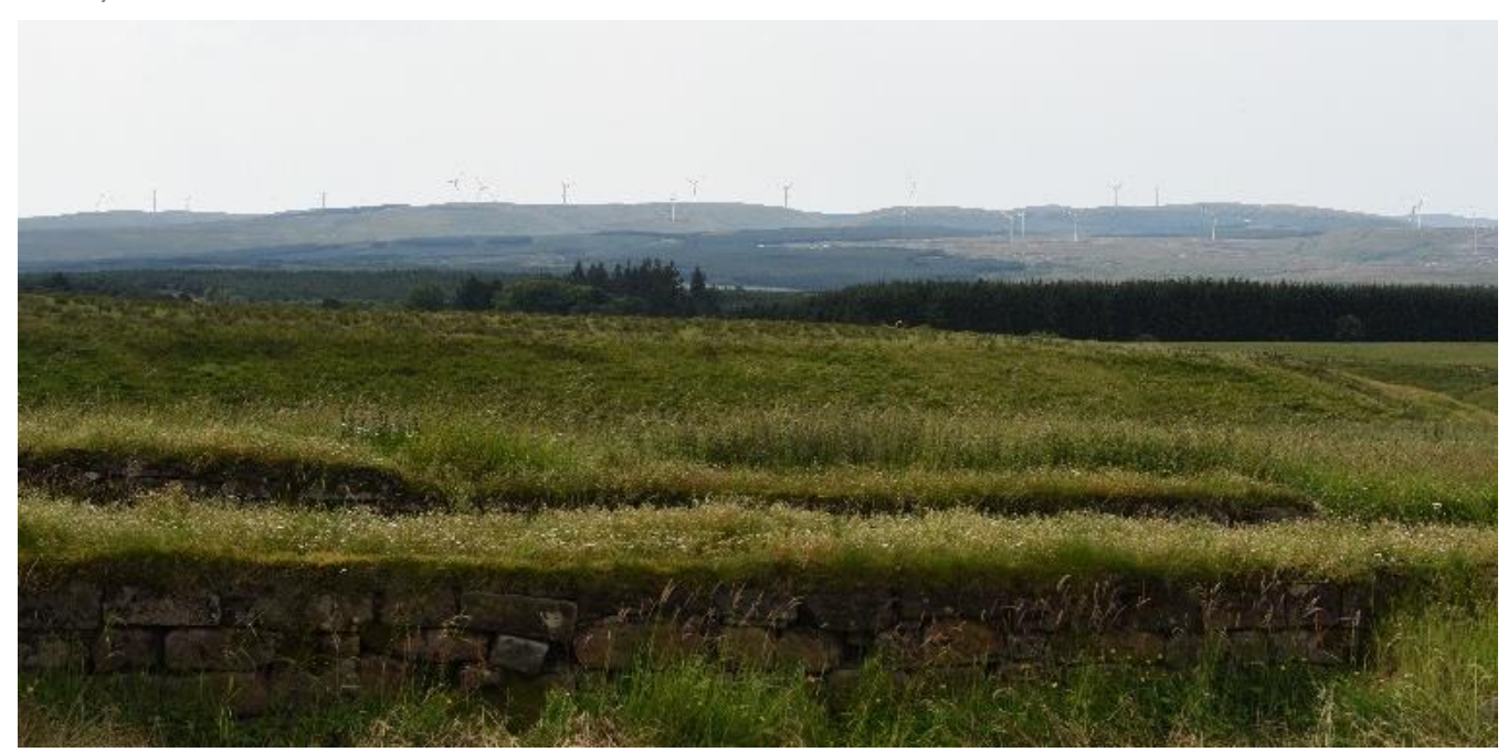
Plate 10.3: View from St Connel's looking south towards the mid to southern end of the GGRP (with Sandy Knowe Wind farm visible)

Plate 10.4: View from St. Connel's church, looking southwest towards the northern end of the GGRP and proposed location of the substation (with the Miners' cairn visible in the foreground)