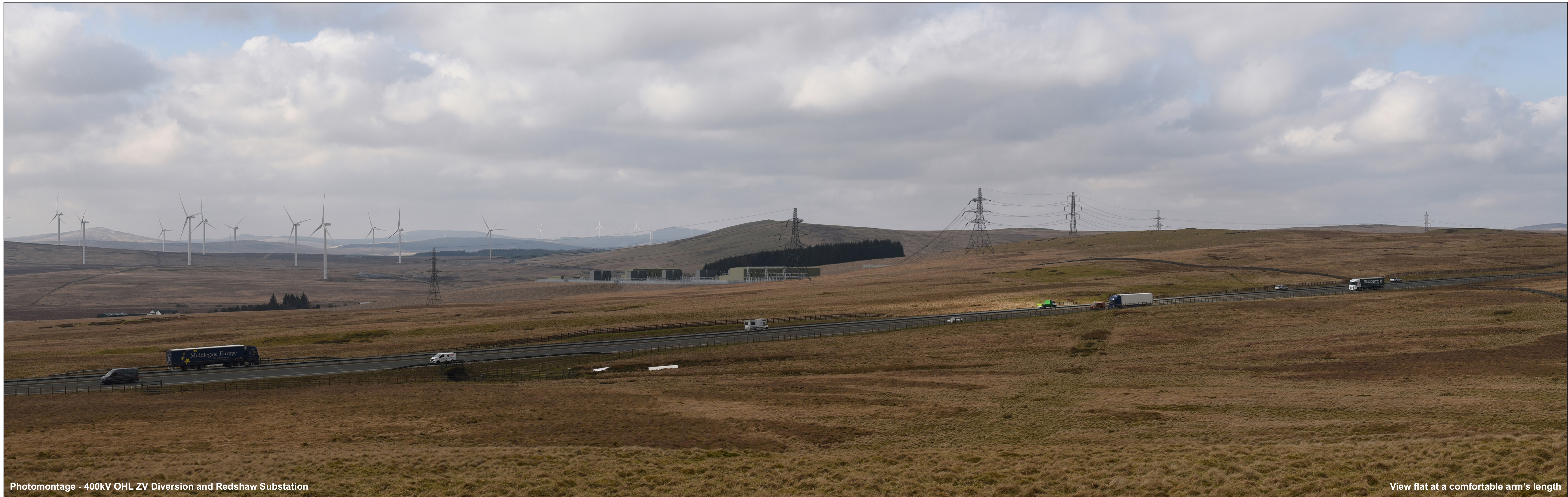
Photomontage - 400kV OHL ZV Diversion and Redshaw Substation