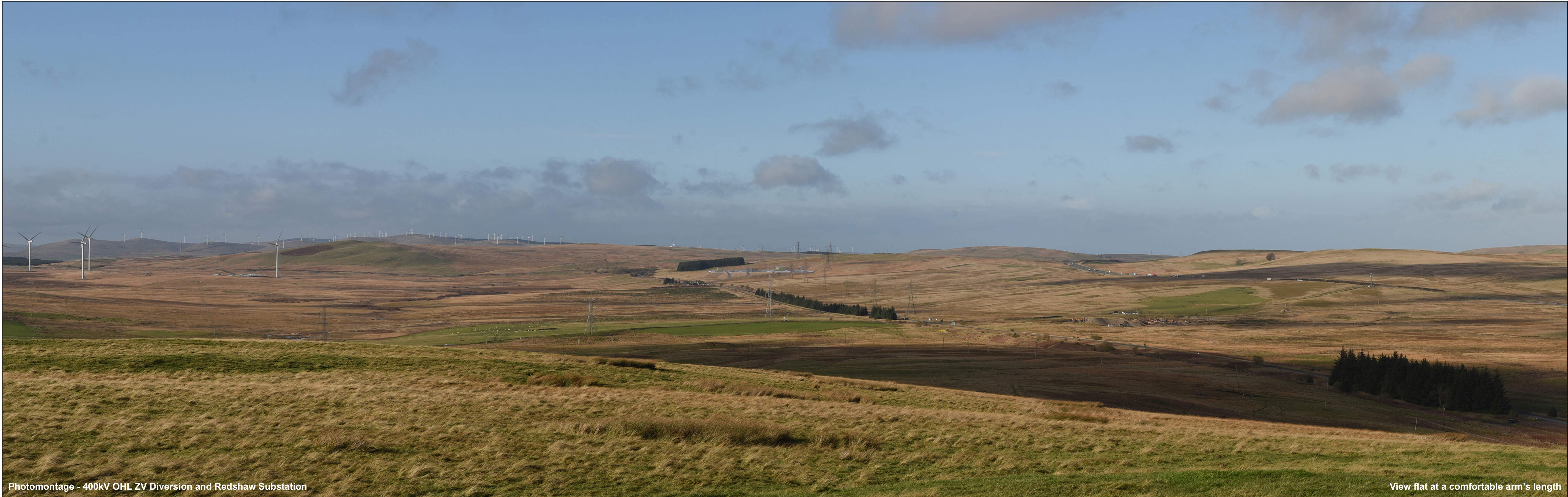
Photomontage - 400kV OHL ZV Diversion and Redshaw Substation