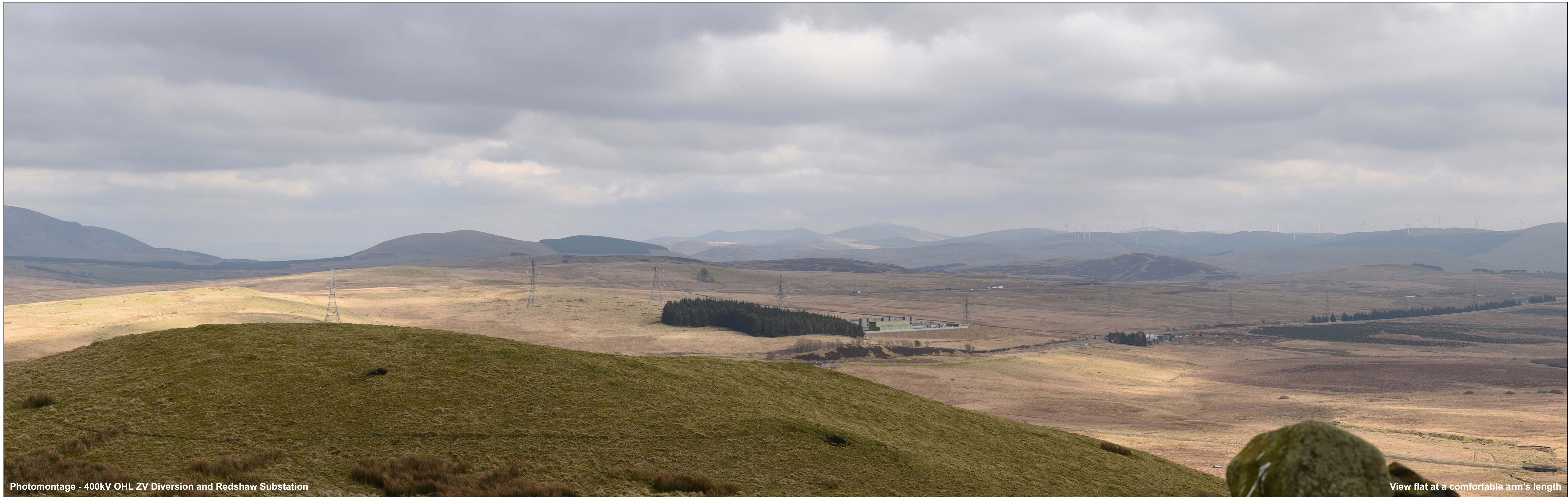
Photomontage - 400kV OHL ZV Diversion and Redshaw Substation