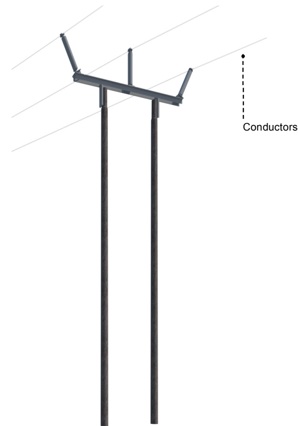
Component parts of 132kV 'Trident' design wood pole: Intermediate (H pole)