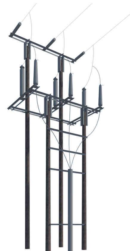
Component parts of 132kV 'Trident' design wood pole: Terminal (H pole)