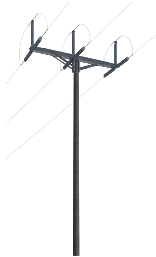
Component parts of 132kV 'Trident' design wood pole: Angle