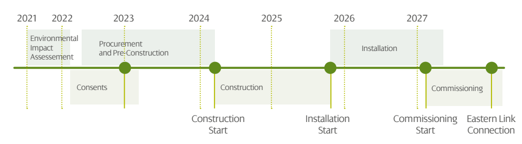
Figure 8.1 Project Timeline

Consultation will run from 31st January to 28th February 2022. The planning application is due for submission in April 2022. Once consented the Eastern Link will commence construction in 2024 and will complete installation by 2027. Following a period for commissioning the link will be connected by the end of 2027. Figure 8.1 below sets out a project timeline.