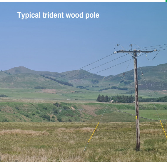
Typical trident wood pole

The precise pole configuration, height and span will be determined after a detailed line design has been agreed.