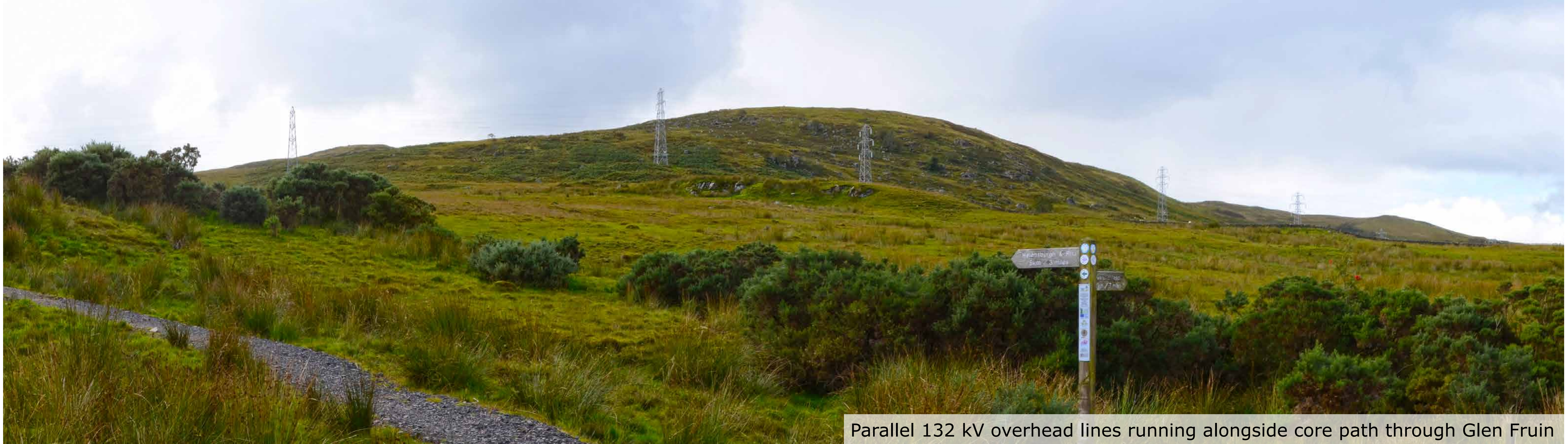
Parallel 132 kV overhead lines running alongside core path through Glen Fruin